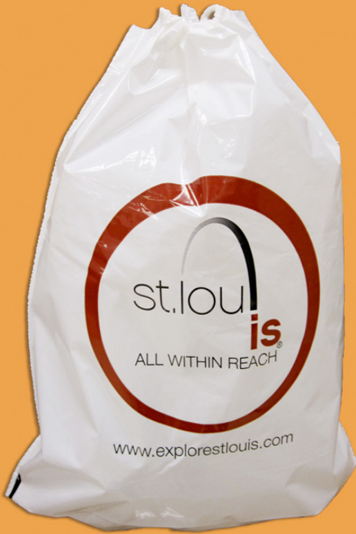
Plastic Drawstring Bag