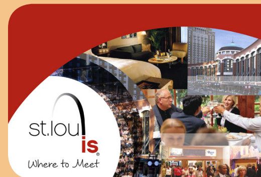
St. Louis Postcard