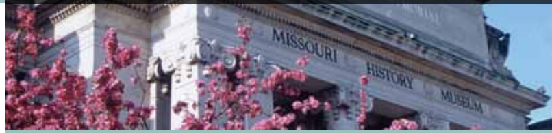
Missouri History Museum

Foodies will find plenty to keep them occupied – and satisfied – in St. Louis. From downtown to West St. Louis County and all points in between, no matter what direction you go, there's an abundance of tasty options. From authentic Asian fare in Grand South Grand to traditional Italian specialties on The Hill, there are more than 1,000 one-of-a-kind restaurants in St. Louis. No wonder St. Louisans rave about local culinary delights like gooey butter cake, toasted ravioli and “concretes,” real custard milkshakes so thick you can turn them upside-down.