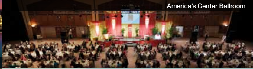
America's Center Ballroom