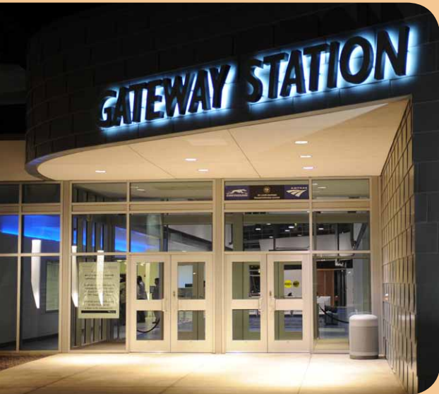
Gateway Transportation Center