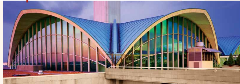
Lambert-St. Louis International Airport