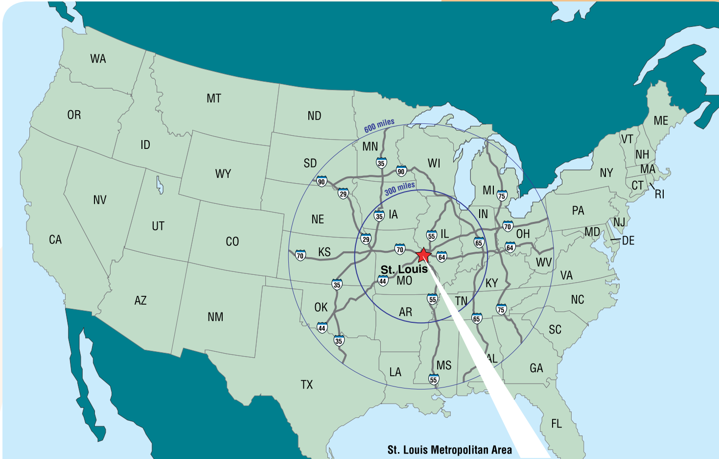
St. Louis Metropolitan Area