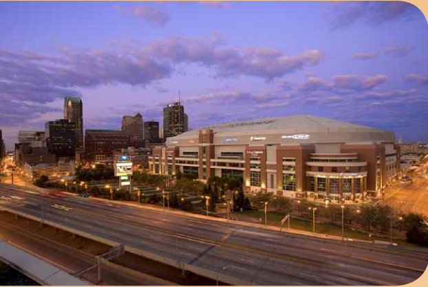
Interstate 70 near the Edward Jones Dome