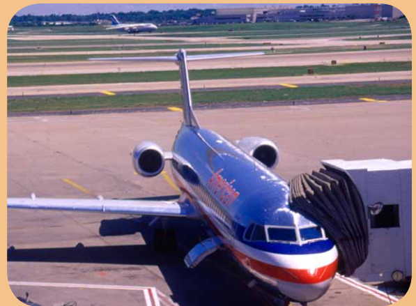
American Airlines jet at Lambert-St. Louis International Airport

Air Canada Air Choice One Air Tran American/American Connection/American Eagle Cape Air Continental/Continental Express Delta/Delta Connection Frontier Airlines Southwest United/United Express USA 3000 USAirways/USAirways Express