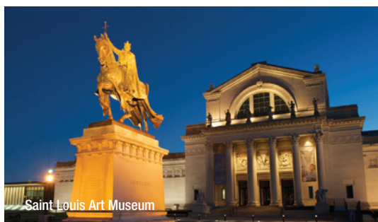
Saint Louis Art Museum

For a complete list of attractions, restaurants, hotels, special events or a sample itinerary, visit explorestlouis.com/groups-reunions or call 1.800.325.7962 and ask for the Leisure Travel Sales Department.