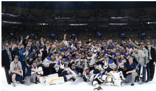
St. Louis Blues Hockey