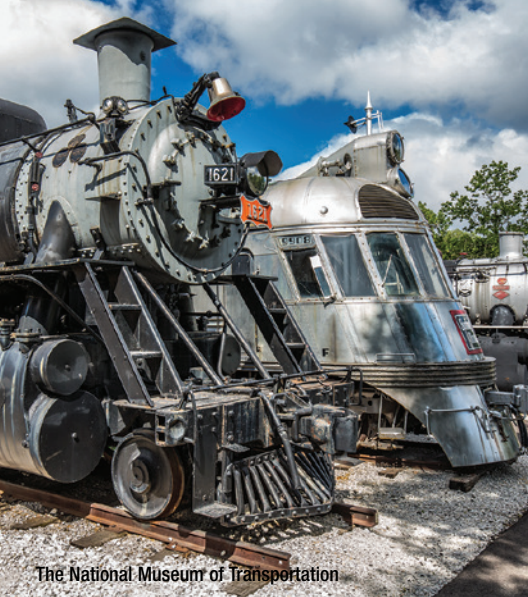
The National Museum of Transportation