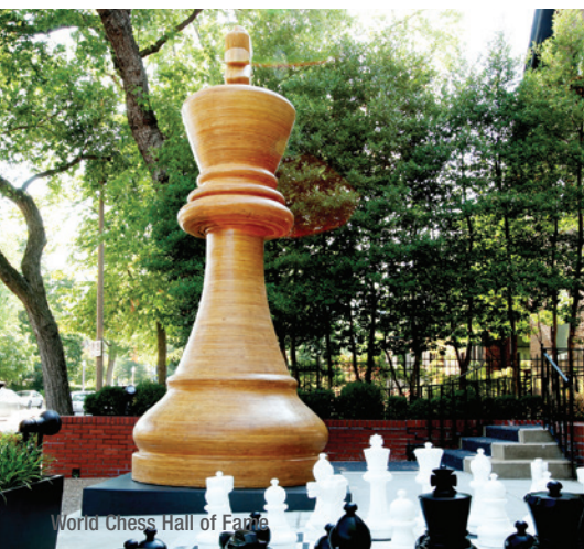
World Chess Hall of Fame

Bringing the great dance of the world to St. Louis for 50 years. Check website for show schedule.