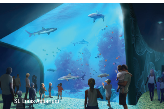
St. Louis Aquarium