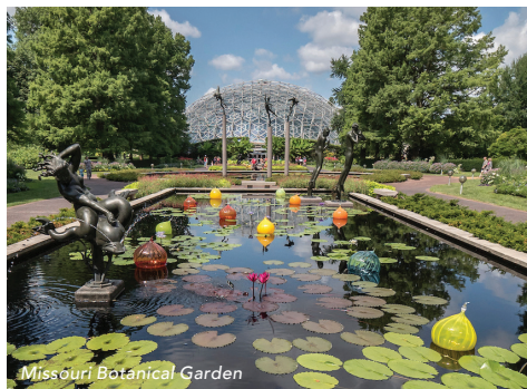
Missouri Botanical Garden

21c Museum Hotel St. Louis AC Hotel St. Louis Chesterfie AC Hotel St. Louis CWE Aloft St. Louis Cortex Angad Arts Hotel Aviator Hotel & Suites Element by Westin Hotel Indigo Hotel Saint Louis, Marriott Autograph Kimpton (opening 2025) The Last Hotel Le Méridien St. Louis Clayton Le Méridien St. Louis Downtown Live! by Loews Residence Inn Clayton Staybridge Suites (opening 2025) Tru by Hilton St. Louis Downtown