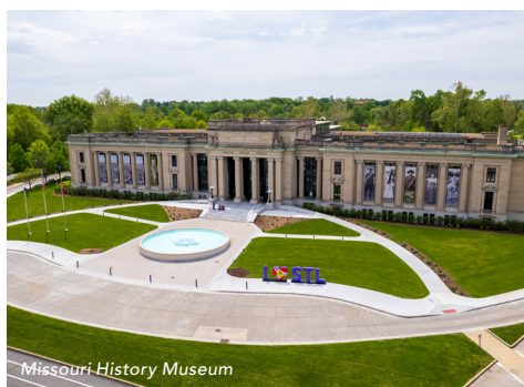
Missouri History Museum