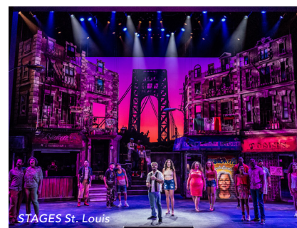
STAGES St. Louis

St. Louis Black Repertory Company theblackrep.org (January-June) St. Louis Symphony Orchestra slso.org STAGES St. Louis stagesstlouis.org (May-October) Stifel Theatre stifeltheatre.com