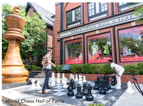
World Chess Hall of Fame