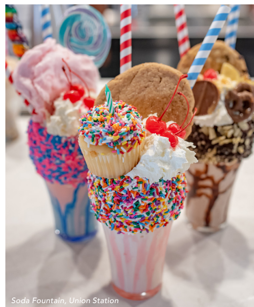
Soda Fountain, Union Station